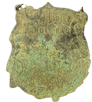
F. 1896 Mardi Gras Badge