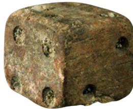
E. Die made of Animal Bone