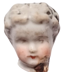
I. Porcelain Doll