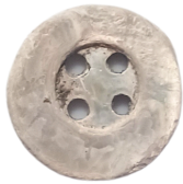
A. Shell Button