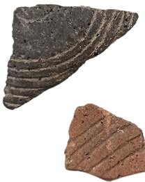
D. Incised Pottery