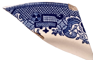
H. Transfer Print Pottery