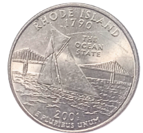
C. 2001 Quarter