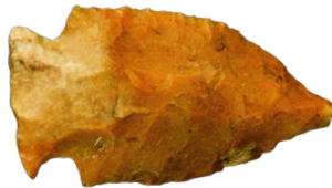
B. Stone Tool